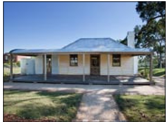
Photos of the Exeter Farm restoration