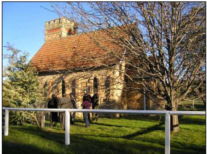
Society members visiting the Chapel at Havilah August 2007