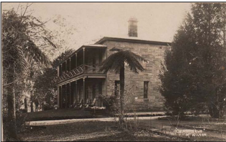
This house is called 'Dennarque' but the tree-ferns are not.