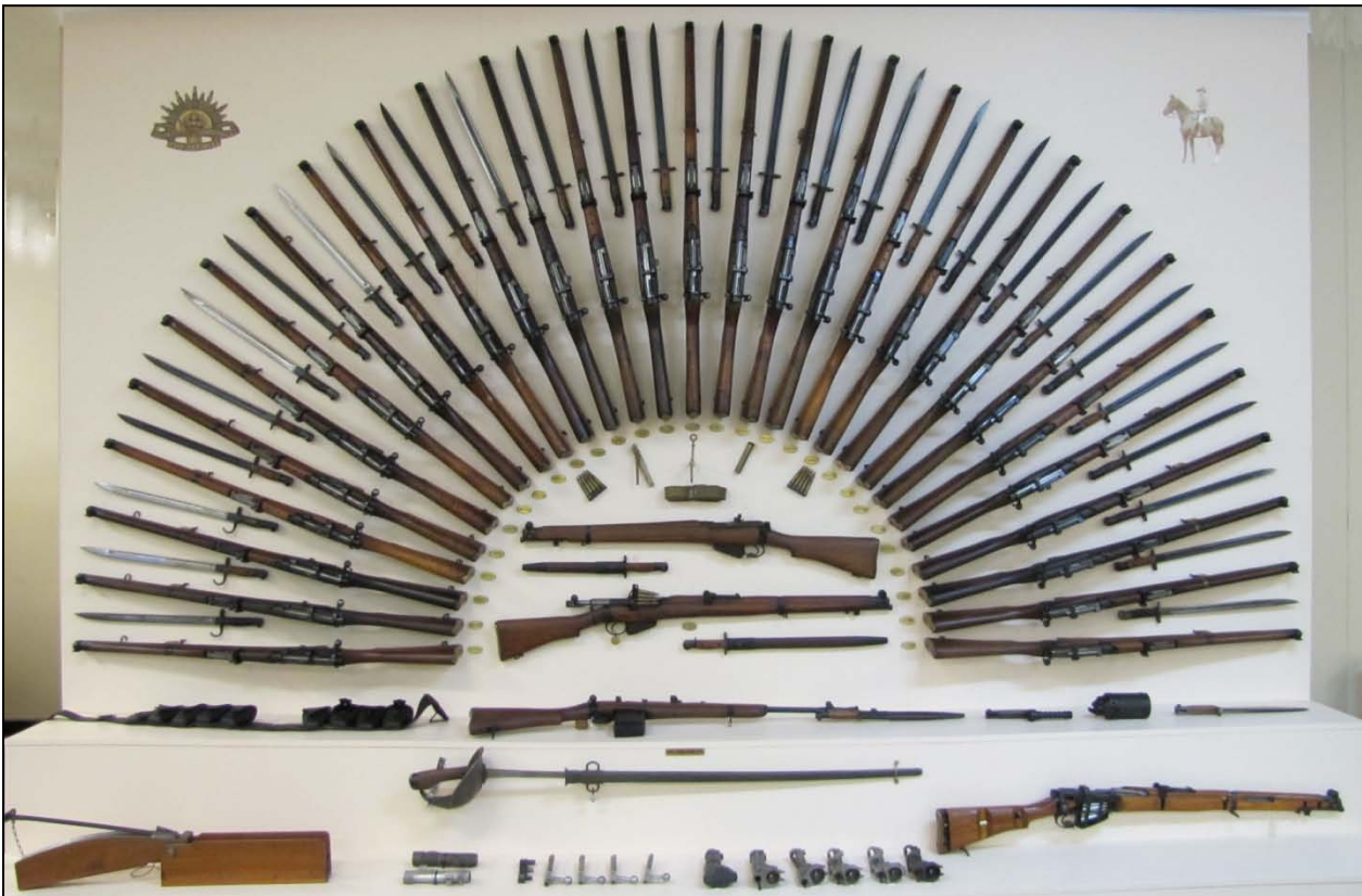
Fan display of rifles and bayonets at Lithgow's Small Arms Factory museum

With the outbreak of WWII manufacture of small arms resumed and, following the evacuation of Dunkirk in 1940, the United Kingdom requested that Australia forward as many rifles as could be spared. In response, 30,000 rifles were sent, severely reducing our own capacity. Action was taken to expand weapon production by erecting new feeder factories, the first at Bathurst followed by Orange, then Forbes, Wellington, Mudgee, Cowra, Young, Parkes, Dubbo and Portland. In 1943 the total personnel employed at Lithgow was 6,000 while a further 6,000 were employed at the ten feeder factories. Weekly production achieved figures of 4,000 rifles, 150 Bren guns and 70 Vickers machine guns.