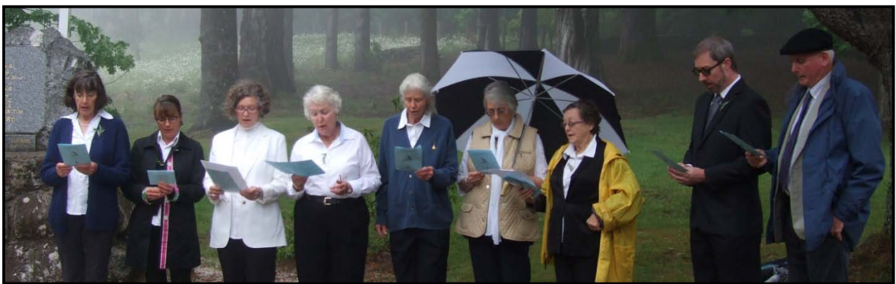
The Mt Wilson choir performing at the 2014 Remembrance Day service

As is the custom, I have chosen two names from the War Memorial, both from our group of first settlers<sup>5</sup> and both fought in WWI.