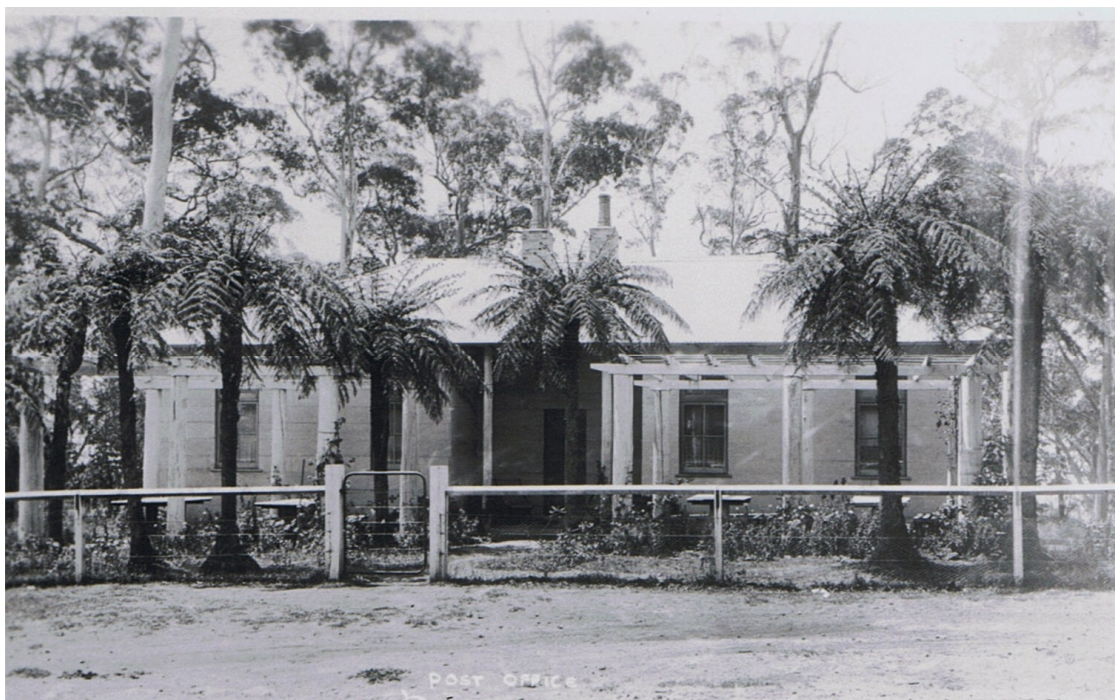
Figure 12. Early photo Mt. Wilson Post Office-house. (Note the Tree ferns; some are still there. - MW&MIHS PO Album).

The New Post Office was completed in 1922 (Figures 11 & 12) and contained a residence as well as limited office space. This simple unadorned building became an important centre for the community of Mt. Wilson, and indeed Mt. Irvine as well. Here people could meet and chat while they transacted business, or collected their mail, or collected the newspaper brought in by the mail contractor of the day. In its very early days a store and Tearoom operated there. The Post Mistress operated both the manual telephone exchange and the Post Office, and was able to maintain close contact with the community and so gave a sense of belonging and identity. In times of crisis, notably bushfires, the Post Mistress was especially valuable in providing information and in maintaining contact with residents.