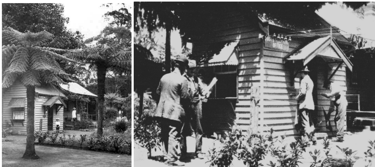
Figure 8. The Post Office at Beowang after the telephone exchange had been installed.