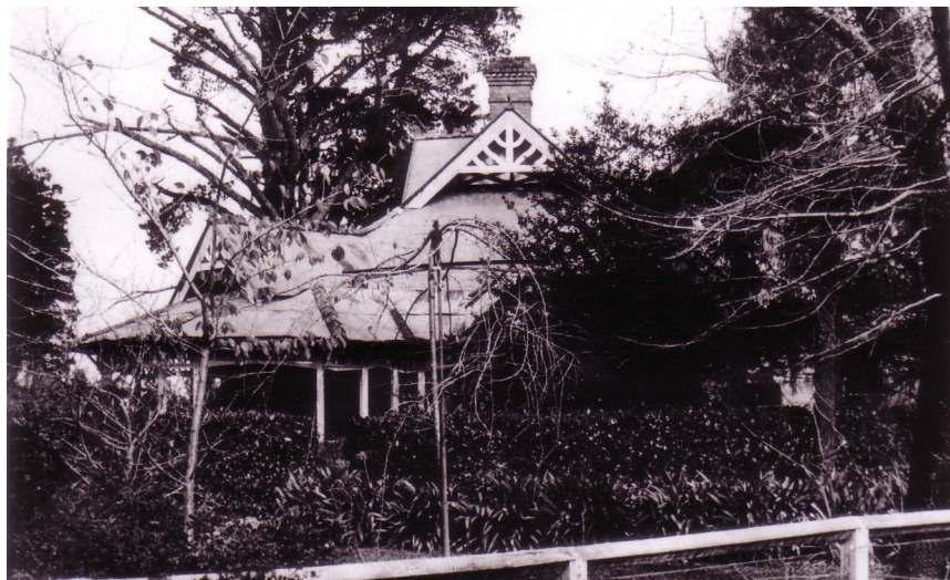
Figure 7. Sefton Hall 1910 viewed from Church Lane (also in James et al. 1969, Figure 1.17).