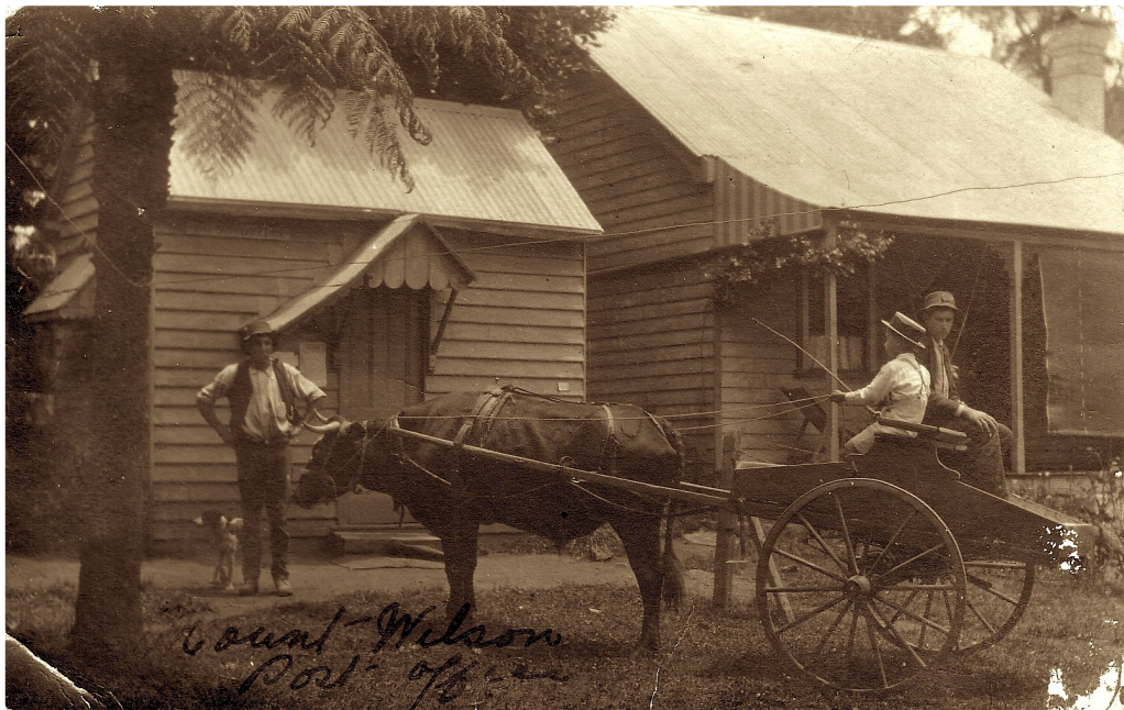
Figure 5. Driving bullock outside The Post Office in Beowang before the telephone was installed in 1916 (Field 1995)

George Henry Cox left Mt. Wilson in 1899, and died in 1901, but the Post Office remained in the grounds of Beowang (Figure 5) from 1890 until 1921-1922 during which time the property was controlled by the Executors of Cox's will.