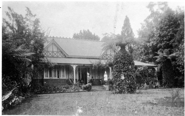
Beowang c 1918